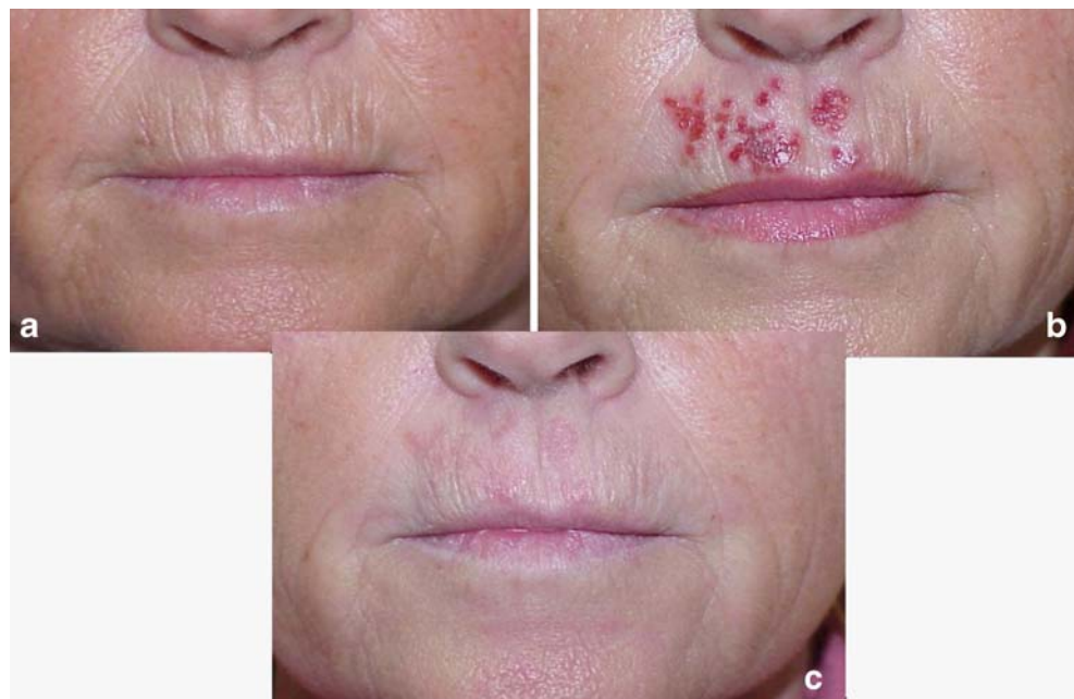
Fig. 4 Caucasian woman, 48 years old, skin phototype II, (a) before and (b) 1 week after fractional resurfacing of the upper lip. Tissue has healed after skin ablation, with clear improvement of the wrinkles; however, clear signs of herpes simplex infection are observed. c Aspect at 2 months after treatment. Herpetic lesion has healed without any scarring, but some lesion-related residual erythema is still present. Wrinkles are significantly better

Fractional resurfacing with Er:YAG laser with low incident doses and few passes for wrinkle treatment will obviously require more than one treatment session to enhance the condition of moderate to severely photo-aged skin. However, each subsequent treatment session at the same parameters will not go any further than the previous